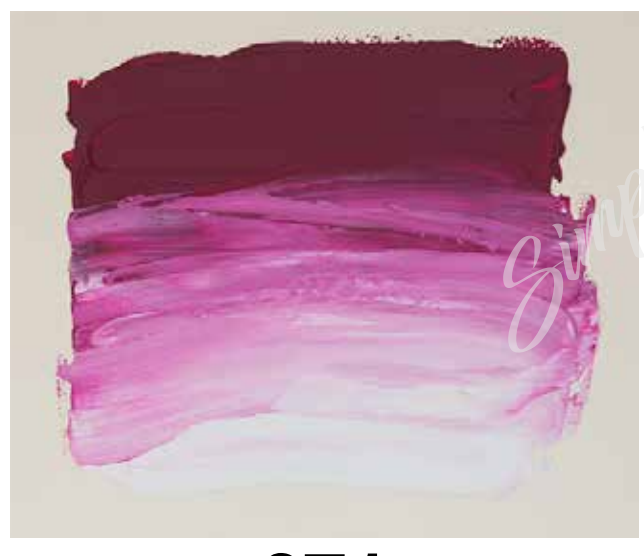
*** 671 Helios purple PR122