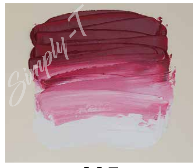
*** 635 Carmine Red PR177