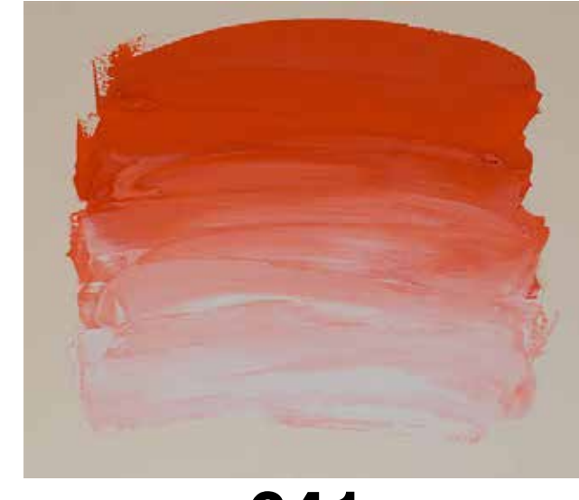
*** 641 Orange PO73