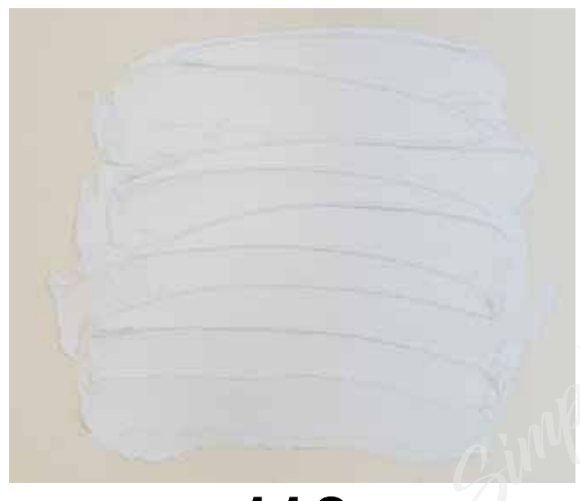
*** 116 Titanium White PW6/PW4