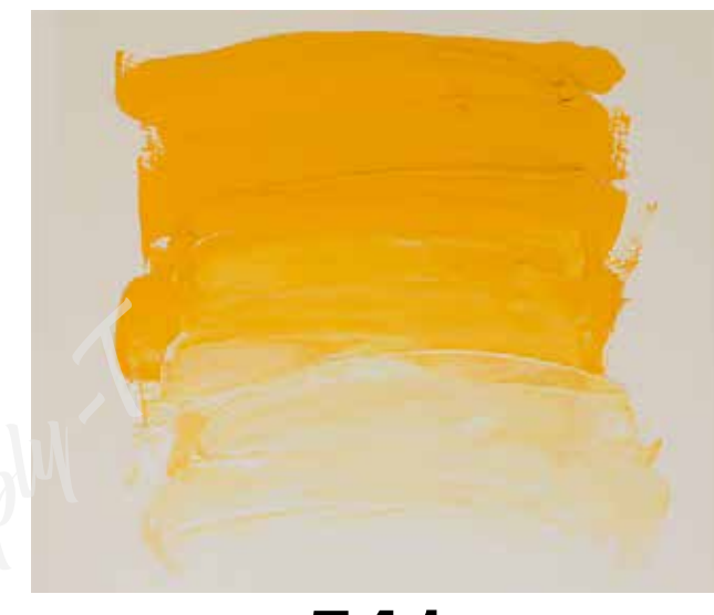
*** 541 Cadmium Yellow Medium Hue nr