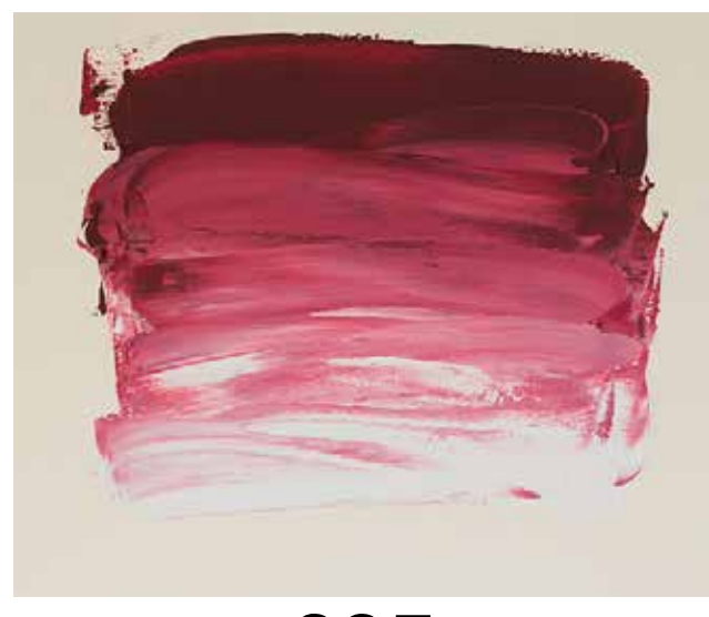
** 695 Alizarin Crimson PR83