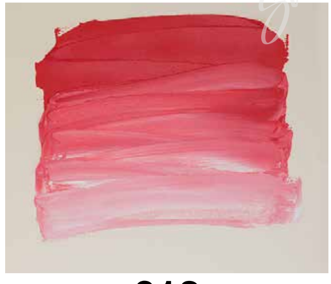
*** 613 Cadmium Red Light Hue nr