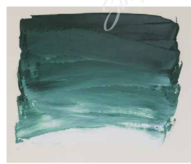
*** 213 Green Earth PG17/PBk11/PY42/PG7