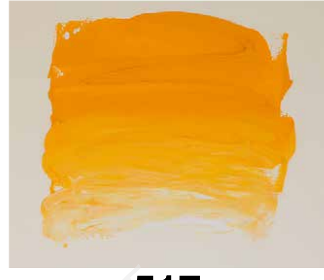
*** 517 Indian Yellow PY65