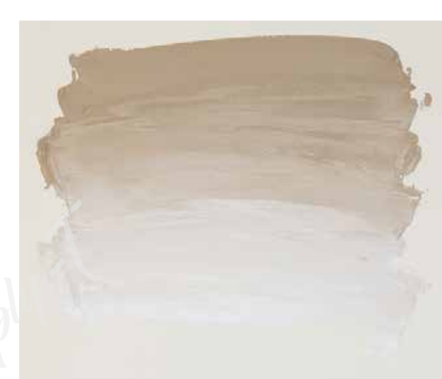
*** 705 Warm Grey PW6/PY42/PR101/PBk11