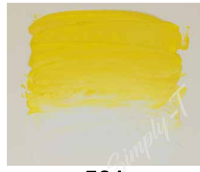
*** 501 Lemon Yellow PY3