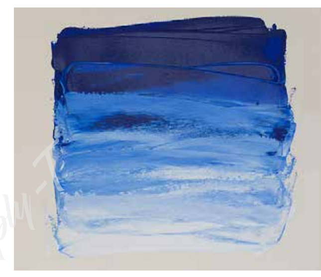
*** 312 Ultramarine Blue Light PB29