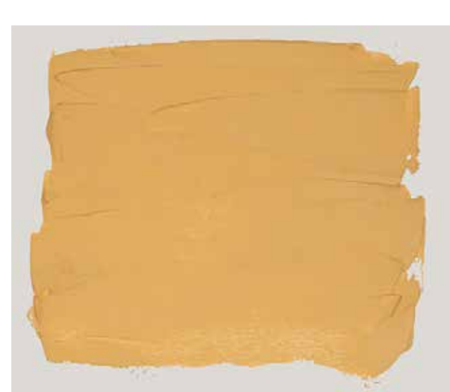
*** 028 Gold Pigments iridescents, PY3