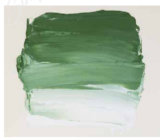
*** 815 Chrome Oxide Green PG17