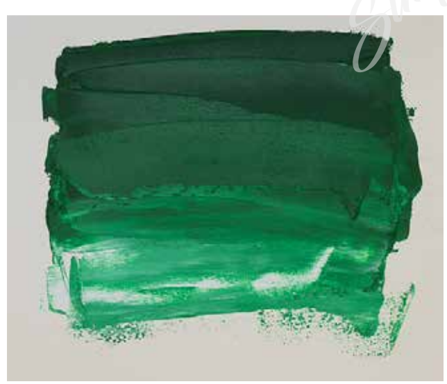
*** 809 Hooker's Green PG36/PY83