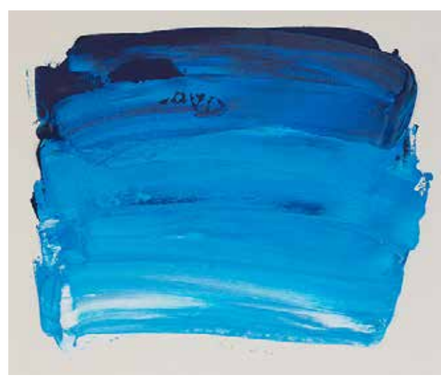
*** 385 Primary Blue PB15:3