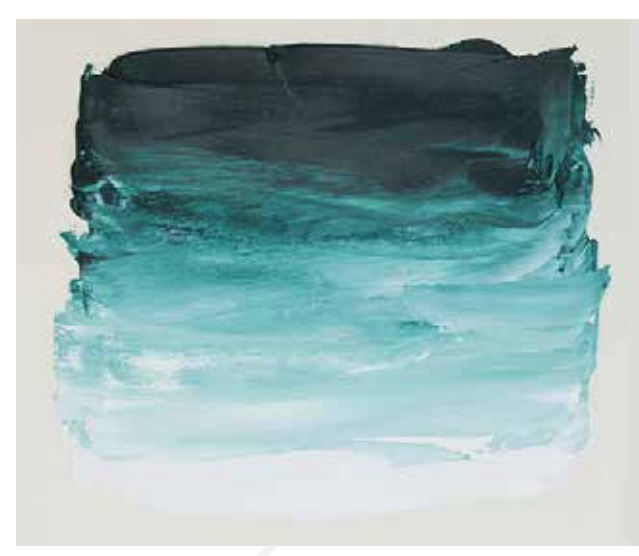
*** 836 Cobalt Green Deep Hue PG26