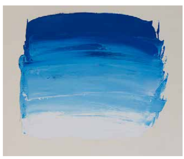
*** 303 Cobalt Blue Hue PB29/PB15:3/PW6