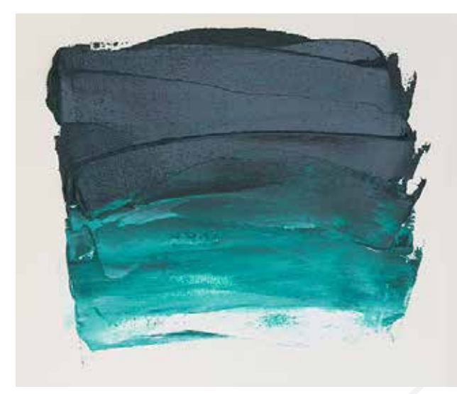
*** 899 Forest Green PG7/PY42/PBk7