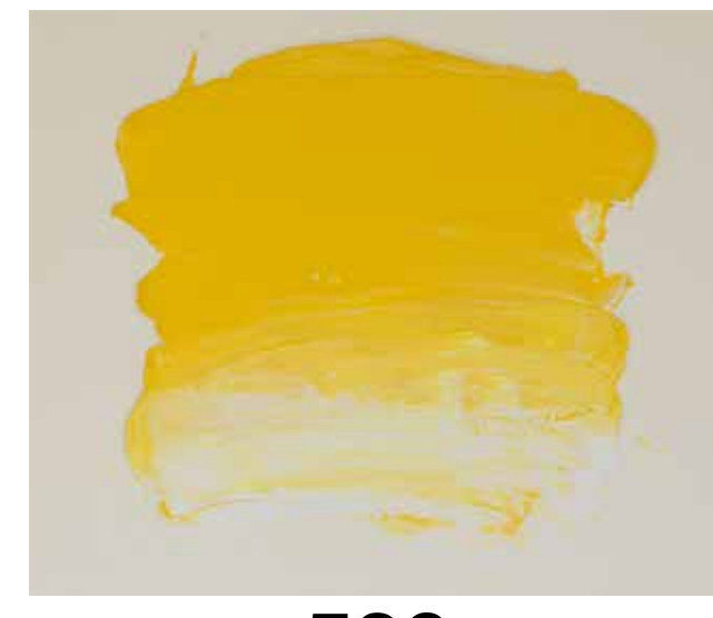
*** 539 Cadmium Yellow Light Hue nr