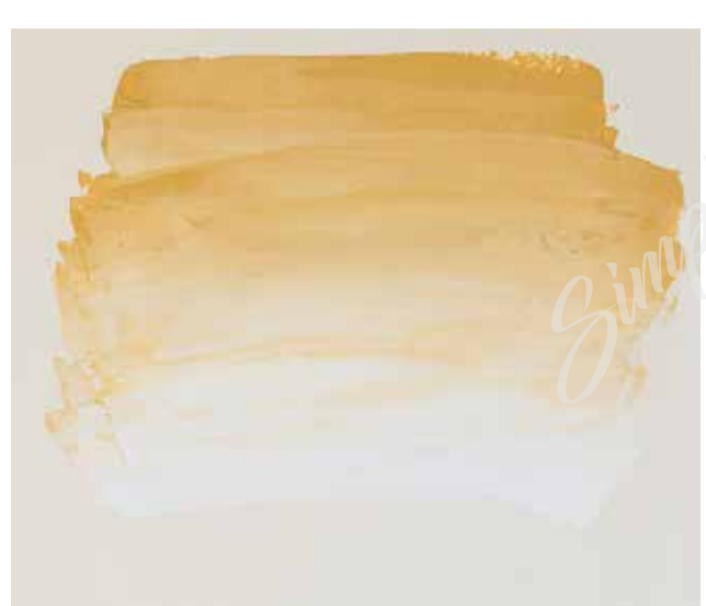
*** 567 Naples Yellow PW6/PY42/PY74