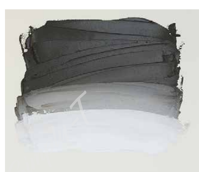
*** 205 Raw Umber PBk11/PY42/PR101/PY74