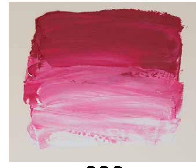
*** 686 Primary Red PV19