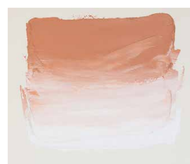
*** 250 Modigliani Ochre PW6/PY42/PR101