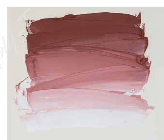
*** 623 Venetian Red PR101