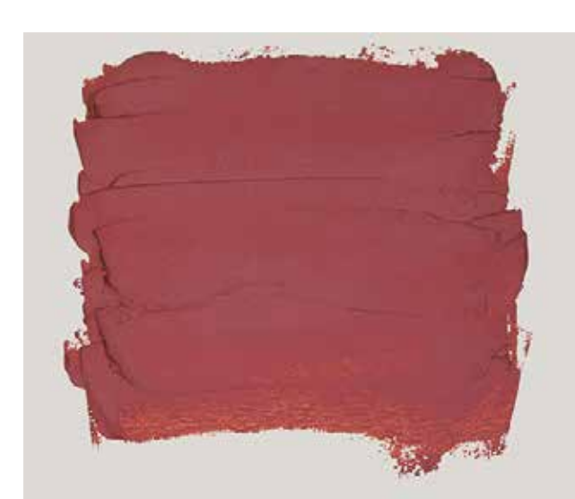
*** 036 Copper Pigments iridescents