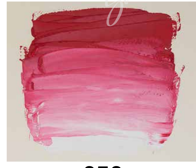
*** 656 Naphthol Red PR170