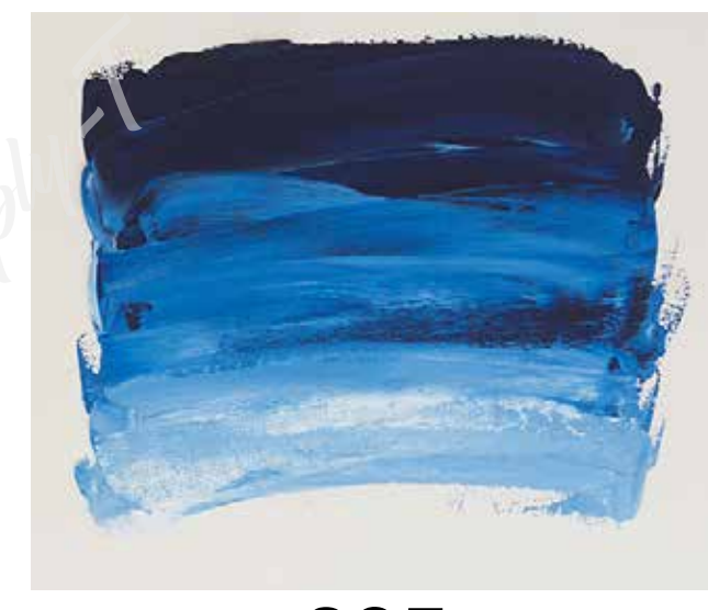
*** 395 Anthraquinone Blue PB60