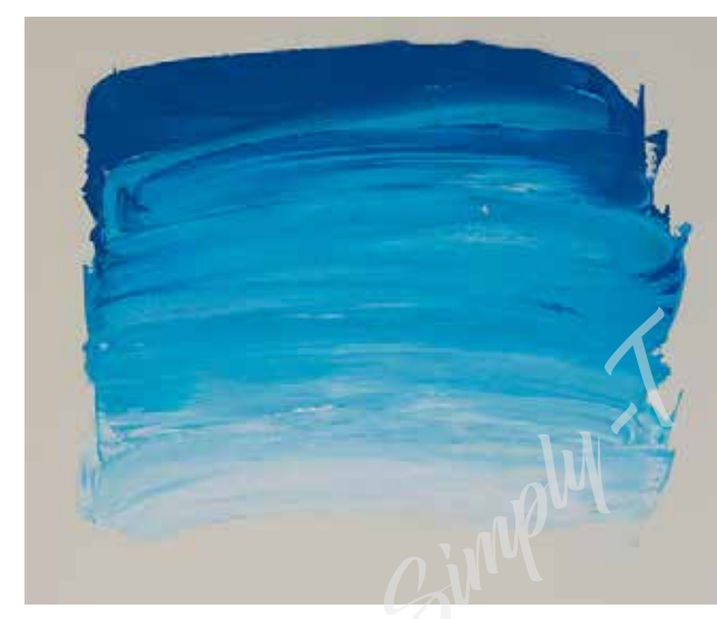
*** 323 Cerulean Blue Hue PB15:4/PW6