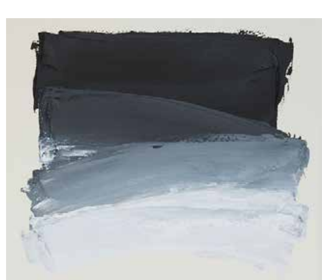
*** 755 Ivory Black PBk9/PBk7