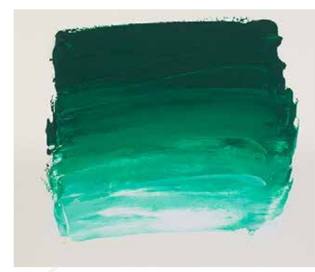
*** 897 Phthalo Green Yellow Shade PG36