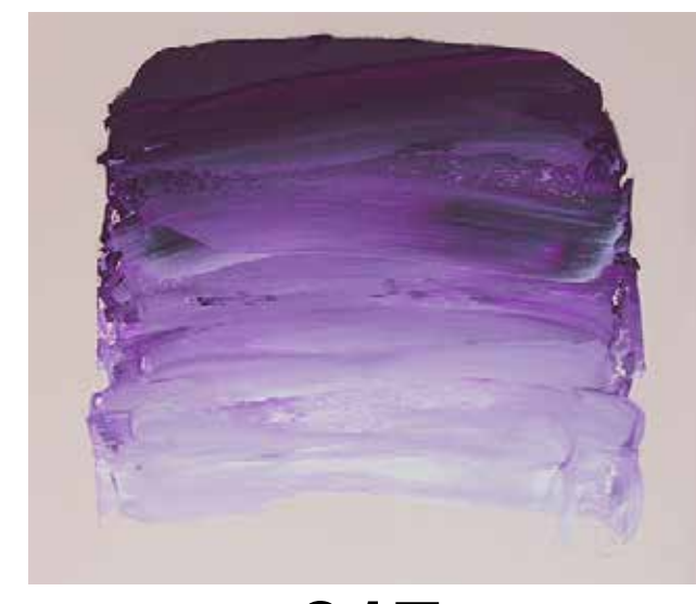
*** 917 Dioxazine Purple PV23