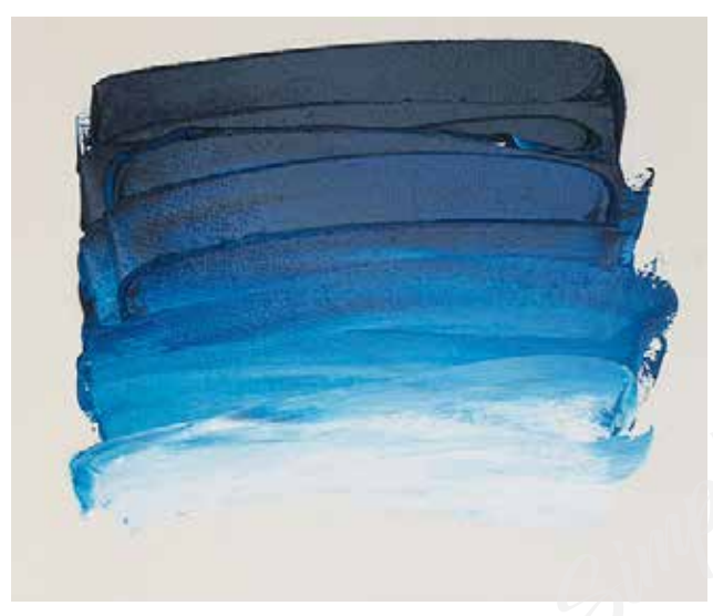
*** 318 Prussian Blue PB27