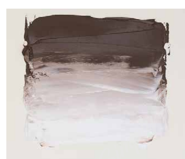
*** 202 Burnt Umber PY42/PR101/PY74/PBk11