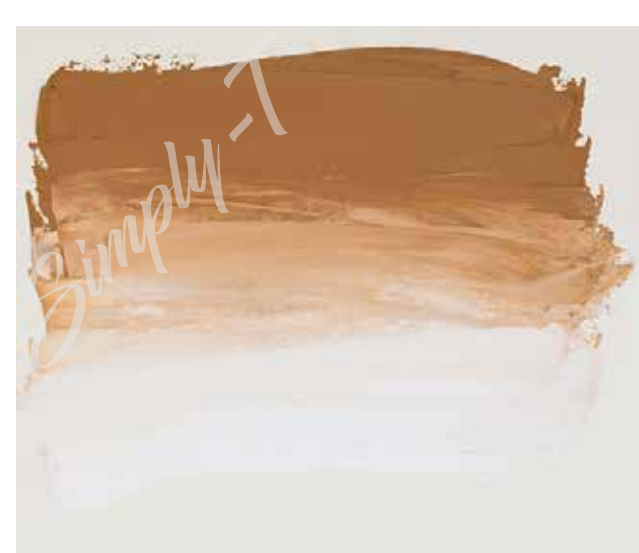
*** 208 Raw Sienna PY42/PR101/PBk11