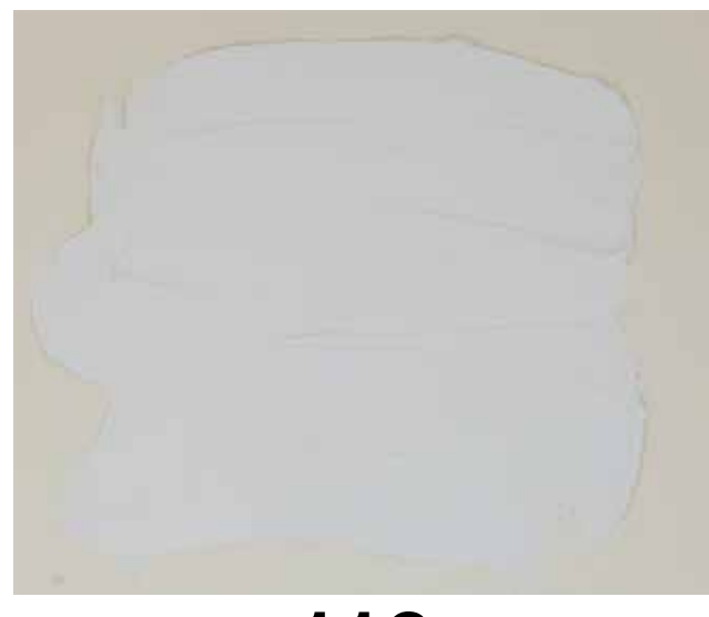
*** 119 Zinc White PW4