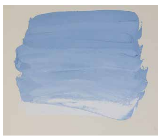
*** 301 Blue-Grey PW6/PB29/PBk11