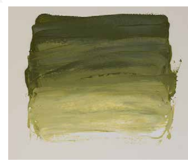
*** 851 Golden Green PY65/PY3/PBk32