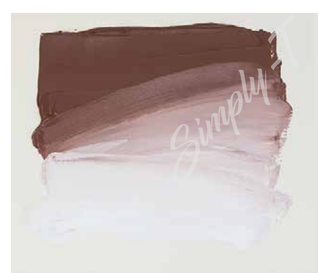
*** 211 Burnt Sienna PR101/PBk7