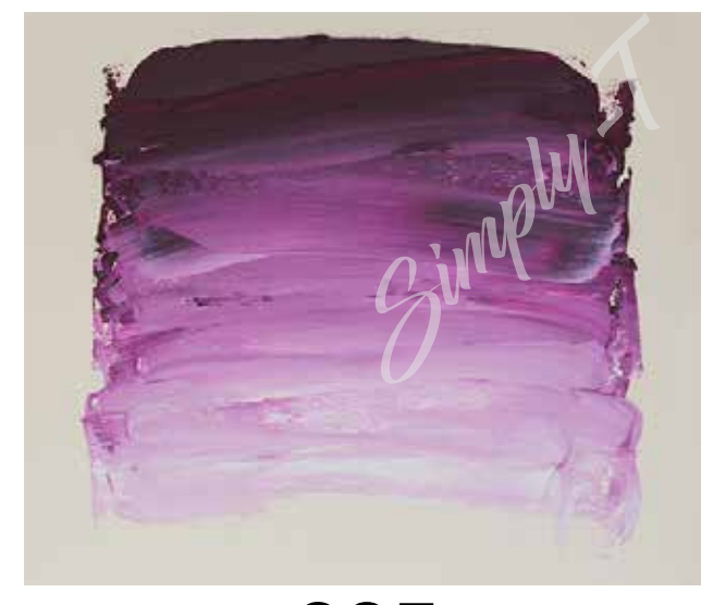
*** 905 Red Violet PR122/PV23