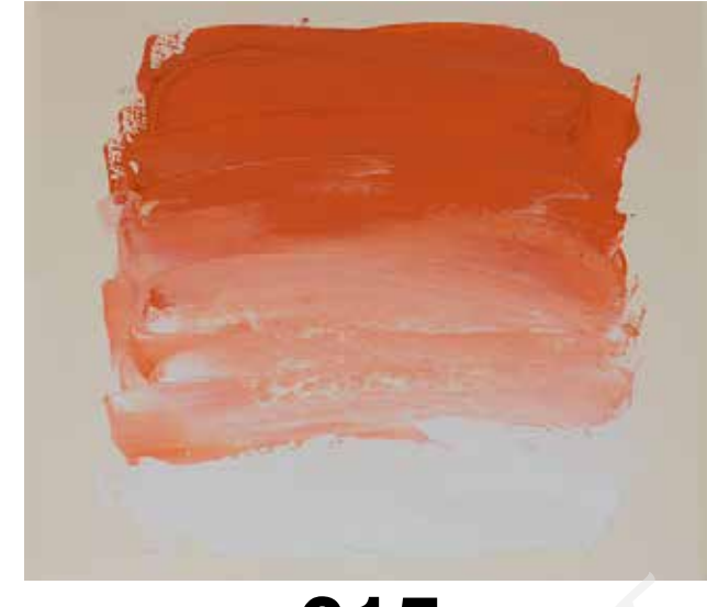
*** 615 Cadmium Red Orange Hue nr