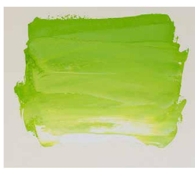
*** 871 Bright Yellow Green PY74/PW6/PG36