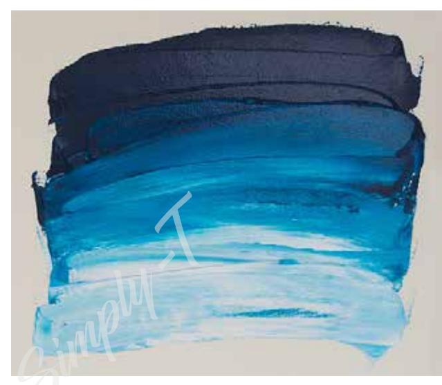
*** 341 Phthalo Turquoise PB16