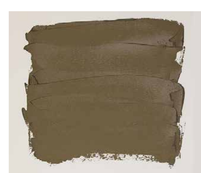
*** 022 Bronze Pigments iridescents, PBk7