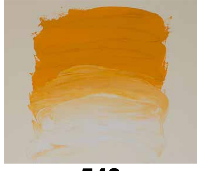
*** 543 Cadmium Yellow Deep Hue nr