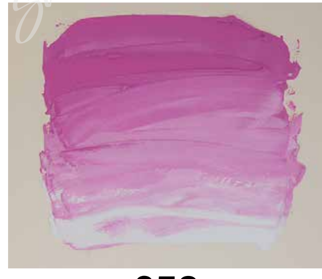
*** 658 Quinacridone Pink PR122/PW6