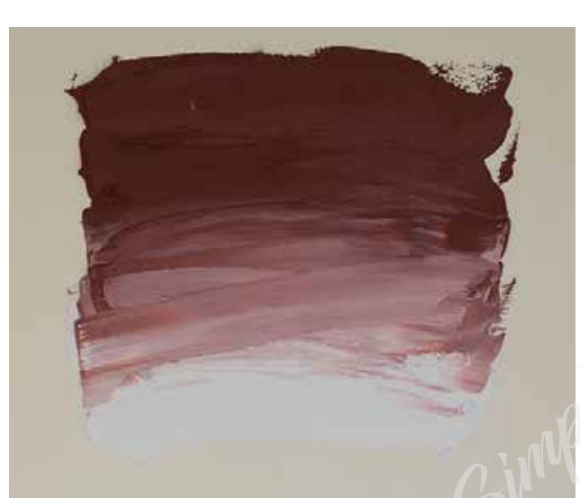
*** 629 Indian Red PR101