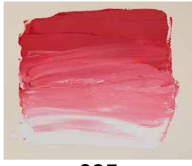
*** 685 Pyrrrole Red PR254