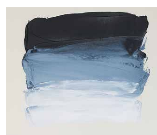
*** 703 Payne's Grey PB29/PBk9