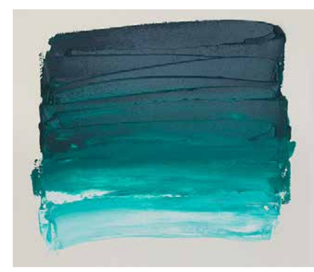
*** 896 Phthalo Green Blue Shade PG7