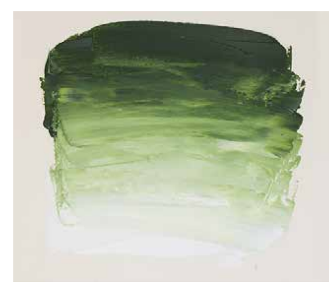
*** 819 Sap Green PY150/PG7/PBk23