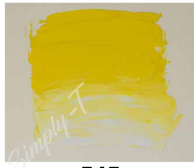
*** 545 Cadmium Yellow Lemon Hue nr