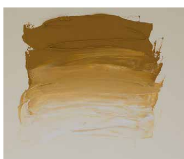
*** 252 Yellow Ochre PY42