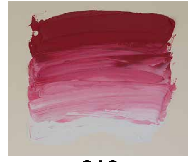
*** 618 Cadmium Red Deep Hue nr/PR122