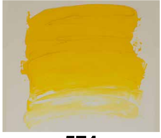
*** 574 Primary Yellow PY74