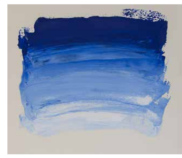
*** 314 French Ultramarine Blue PB29