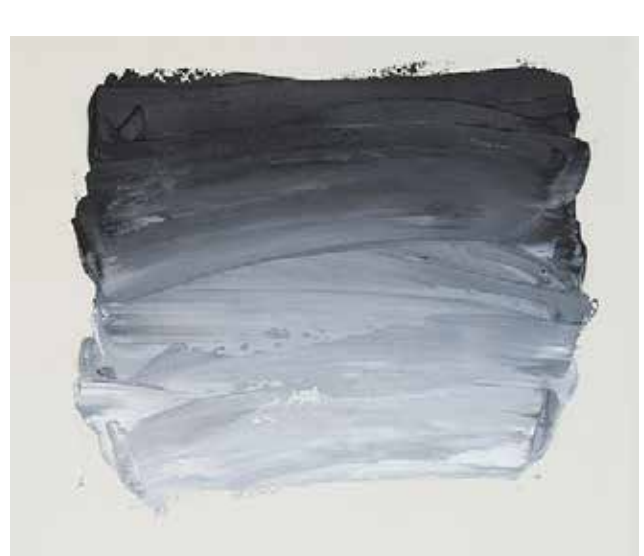
*** 759 Mars Black PBk11