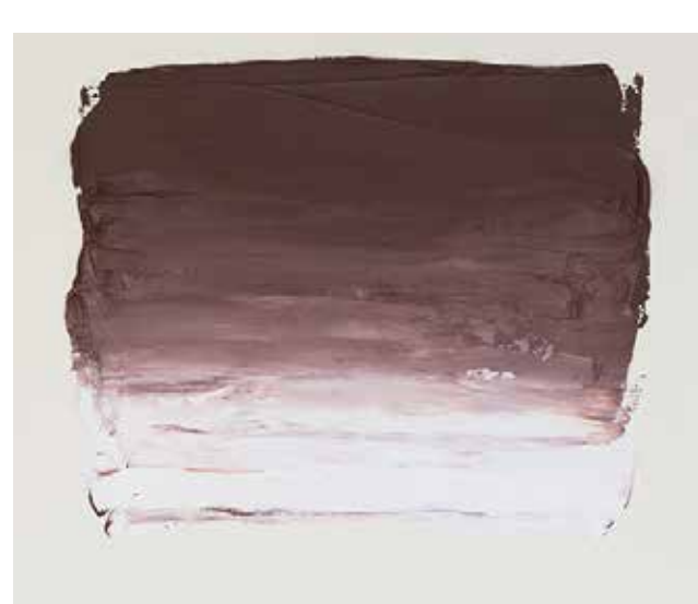
*** 407 Van Dyck Brown PR101/PBk7